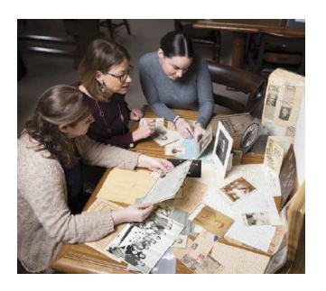
Wyner Family Jewish Heritage Center